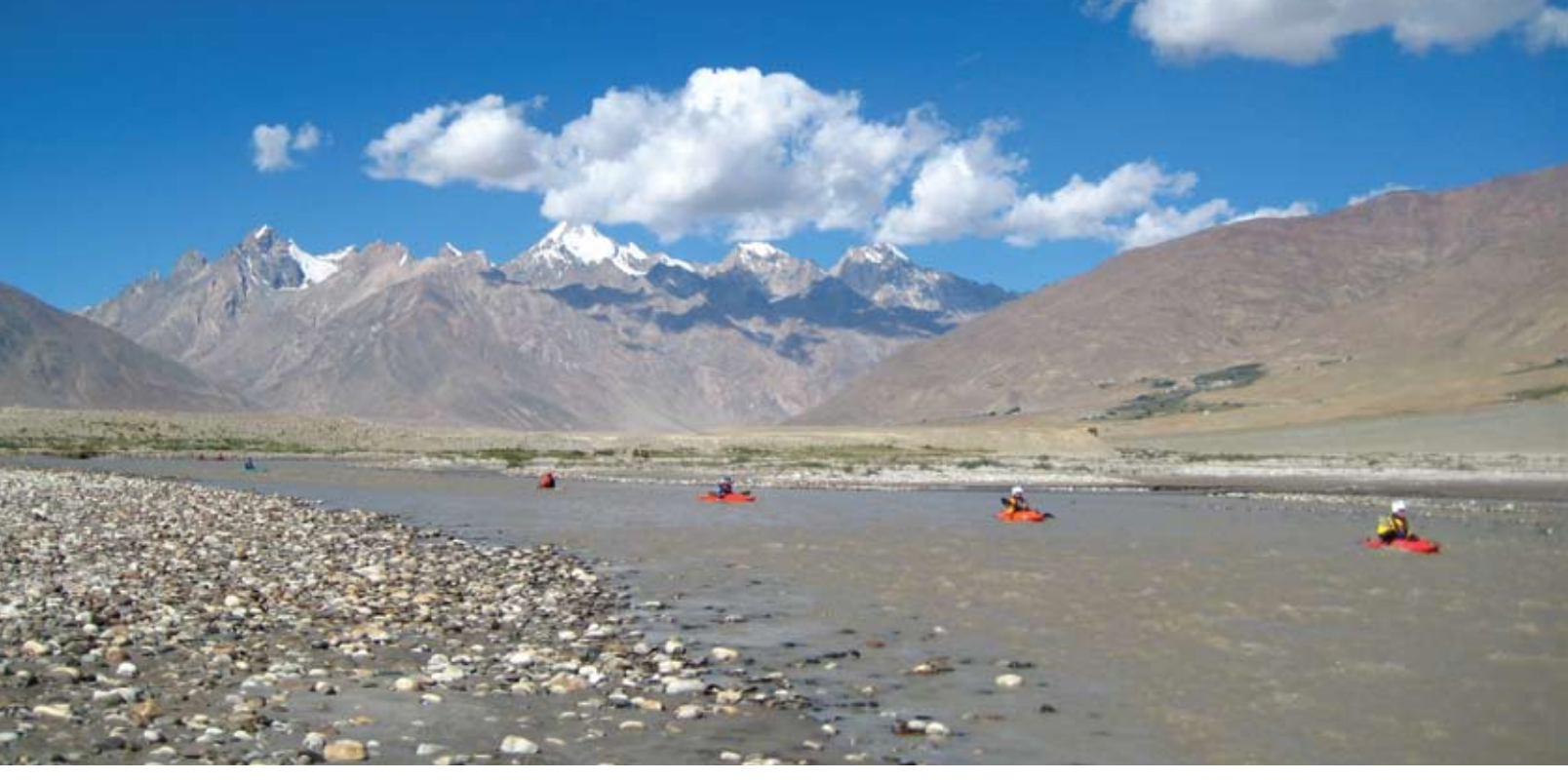
A typical scene from the first few days of the trip: tame whitewater is more than compensated for by the breathtaking scenery.

Zanskar). With the water barely above freezing and no sunshine in the depths of the canyon, our crew were determined to thwart the Zanskar's best efforts to eject us from the relative warmth and safety of our raft.